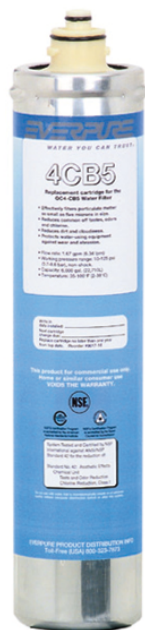
4CB5 Replacement Cartridge: EV9617-11

Delivers quality water for foodservice, vending and OCS applications